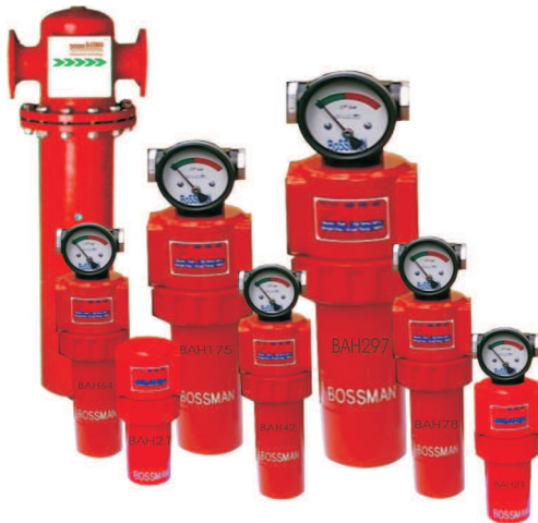
Compressed air micro filter

Ultimate in Filtration & Purification Technology